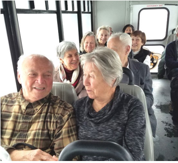
A full bus of WN members enjoyed visiting the Yale Museum in New Haven, CT, on April 1.