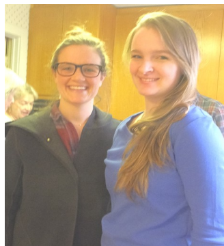
The Whitings' granddaughters helped make the party a success